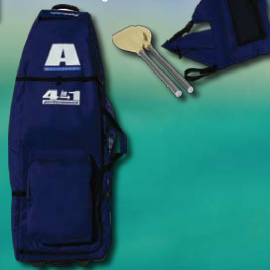
Deluxe Travel Bag